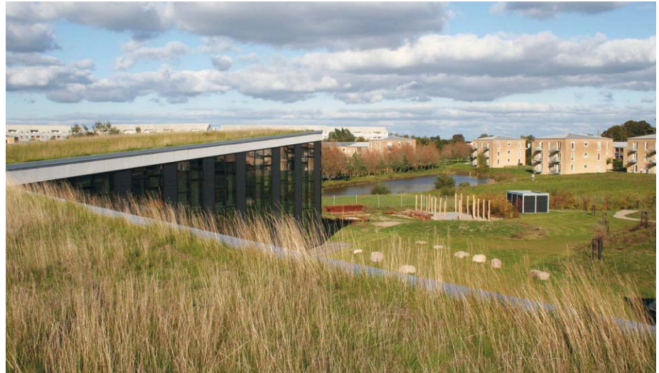
View from the roof edge of the day-care centre over the playground.