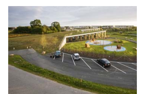
Around one year after completion of the green roof it can hardly be distinguished from the surrounding landscape any more.

Roof construction with root resistant waterproofing