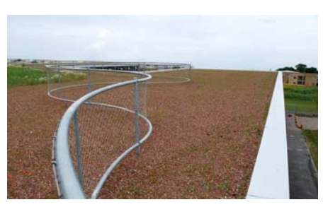
The roof is accessible up to the curving fence.