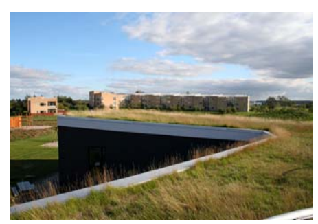
The roof of the day-care centre has an inclination of roughly 3%.